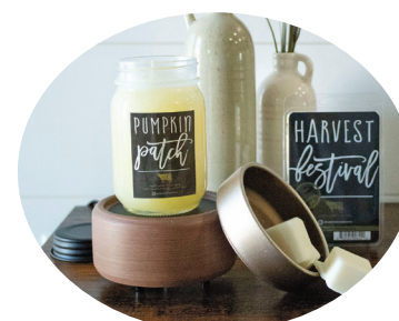
Pewter Walnut 2-in-1 Melter