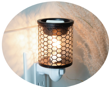
Chicken Wire Mini Plug-in Melter