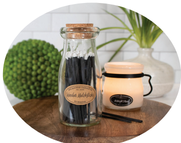
Matchsticks in Milkbottle 4 Pack (Roughly 60 matches per bottle)