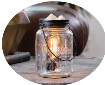
Mason Jar Edison Melter