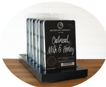
Display Wooden Holder holds 6 Melts - 6 Pack (5x9x.75 inches)