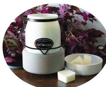
Gray Texture 2-in-1 Melter