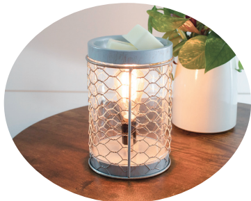
Chicken Wire Vintage Melter