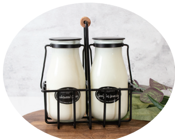
2 Cell Metal Milkbottle Holder