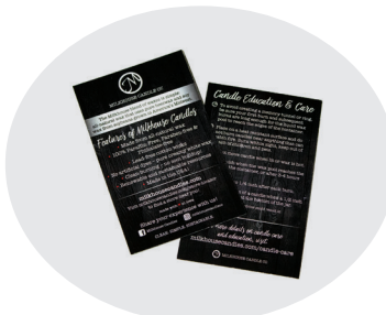
Small Candle Care Card 24 Pack (2.5x4 inches)