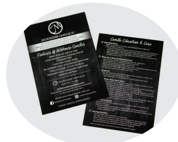
Large Candle Care Card 24 Pack (4x6 inches)